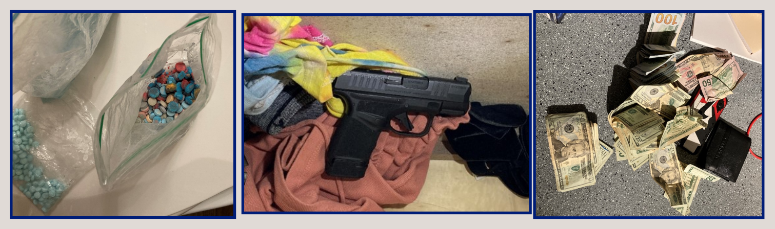
Fentanyl, firearm, and cash seized from overdose death investigation

During the overdose investigation 4 subjects were arrested, over 1,000 fentanyl pills seized, cash and a 9mm handgun seized. Investigative tactics included a Snap Chat warrant, phone ping warrants, tracker warrant and a Federal search warrant for the residence.