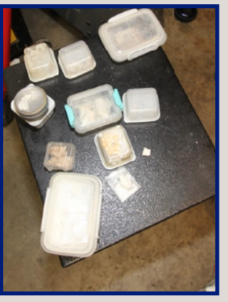
Gresham drug seizure