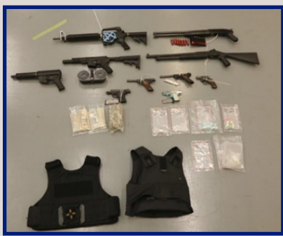
Pictured above and below: drugs, firearms, ID's, and cash seizure

The suspect was arrested a second time after his release and was found with more fentanyl and another gun. The suspect is being federally prosecuted.