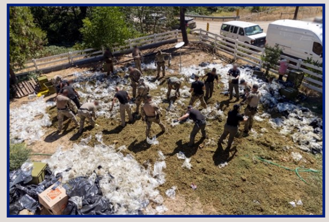
Preparing marijuana for destruction