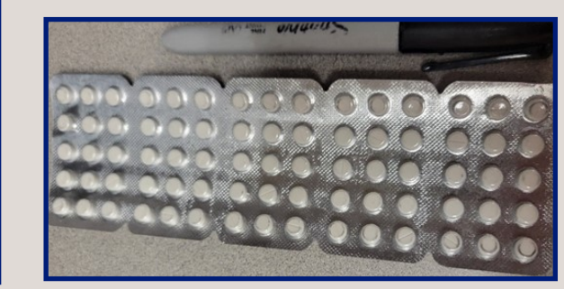
Pictured below and right: packaged pills from India