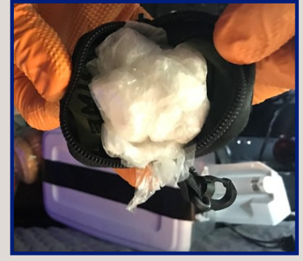
A portion of the fentanyl powder seized by MADGE

• MADGE opened an investigation into multiple subjects selling fentanyl in Jackson County. A search warrant was executed at the suspect's home in White City, OR. Three subjects were arrested and charged with possession, manufacturing, and distribution of a Schedule II controlled substance. A total of 1.06 pounds of fentanyl powder, 1.00 pound of psilocybin mushrooms, 45.56 grams of methamphetamine, and $400 was seized.