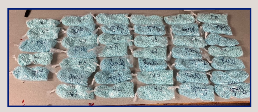
40,000 fentanyl pill seizure out of Mexico

The narcotics team made arrangements with an unknown male to purchase a large amount of fentanyl pills. A male arrived in Beaverton, OR the following day, with 40,000 fentanyl pills (blue M-30). The male was arrested and pills seized. The pills were stored in tied of plastic bags of 1000. The bags were marked with "RINO" or "FA" in permanent pen.