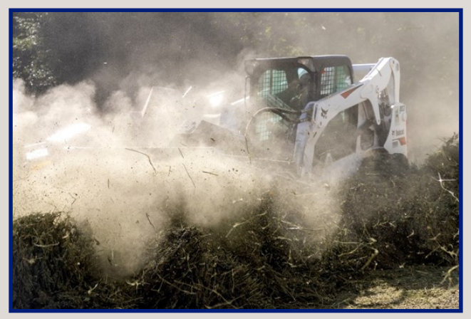
Destroying marijuana plants and processed marijuana