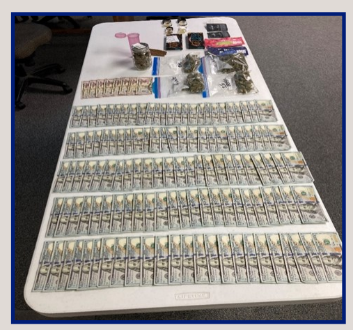
Currency and marijuana seized from the Nissan

While searching the vehicle, the trooper found 57.3 grams of methamphetamine, 97 fentanyl pills, and $7,301 in currency.