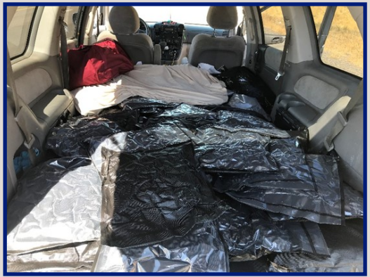
Marijuana seized from the Kia

During the stop, the trooper detected the odor of marijuana and observed cannabis wax in plain view in the vehicle.