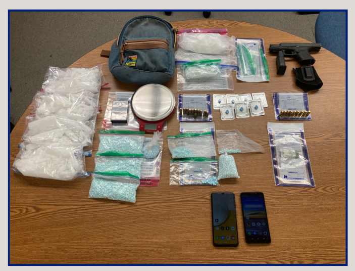
Drugs and firearms seized by BENT

Over the course of the investigation BENT seized over 8 pounds of methamphetamine, over 6,000 dosage units of fentanyl laced pills and 1 handgun.