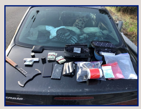
Cash, paraphernalia, and controlled substances seized from the Impala stop

• On August 25, 2022, an ISP trooper conducted a traffic stop in Bonneville County on a brown Nissan Sentra for vehicle tint violations. During the stop, the trooper encountered a strong odor of marijuana emanating from the vehicle. While searching the vehicle, the trooper found $12,500 in cash, eight ounces of marijuana, and various marijuana edibles.