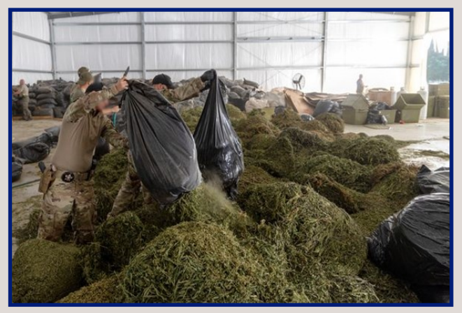
Part of the 150,923 pounds of processed marijuana that was destroyed