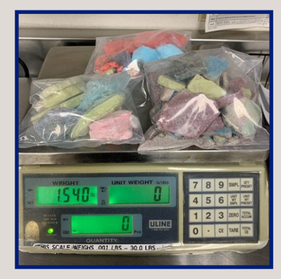
1.54 pound fentanyl seizure

• Many of the recent fentanyl pill and powder cases that MADGE has been working originate with fentanyl being brought up and down the I-5 corridor as well as from suspects driving to the San Francisco Bay area and purchasing fentanyl to sell in the Rogue Valley. One recent case resulted in the seizure of 1.54 pounds of fentanyl powder being seized from a suspect.