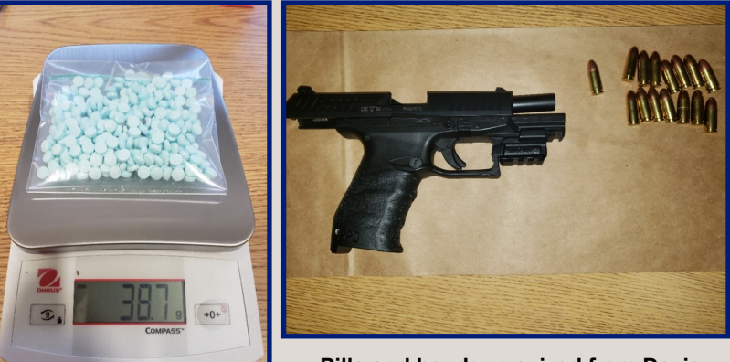
Pills and handgun seized from Davis

• On August 14, 2022 an OSP Fish and Wildlife trooper assigned to the St. Helen's office overheard a radio broadcast from Columbia County 911 regarding a driving complaint. The caller stated the vehicle was unable to maintain its lane of travel while traveling westbound on Highway 30 entering the city of Rainer. The Fish and Wildlife trooper located the vehicle as it pulled into the Grocery Outlet in Rainer. As the trooper walked up to contact the driver she observed the driver attempting to reach for a cigarette and a snorting straw inside the center console. When the driver became aware of the trooper's presence she dropped both items on her lap. The trooper also noted the driver was visibly intoxicated.