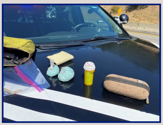
Fentanyl and methamphetamine seized from the Toyota Camry