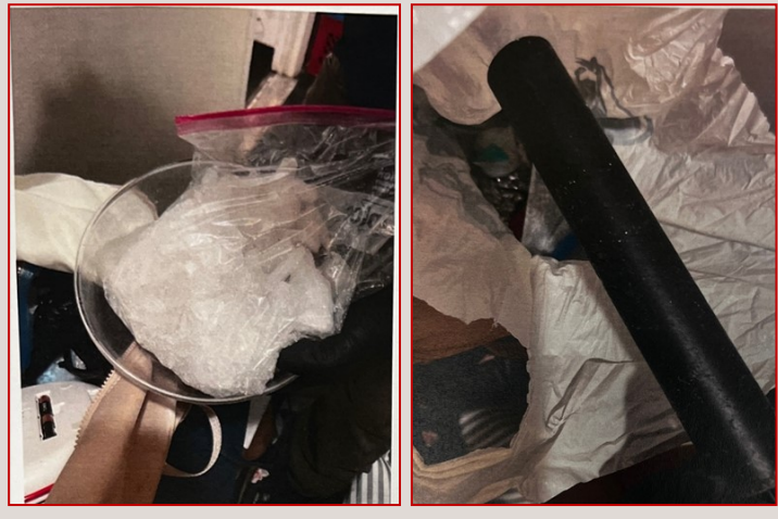
Pictured above: cocaine and suppressor seized by DDT

Pictured left: fentanyl, cash and firearms seizure