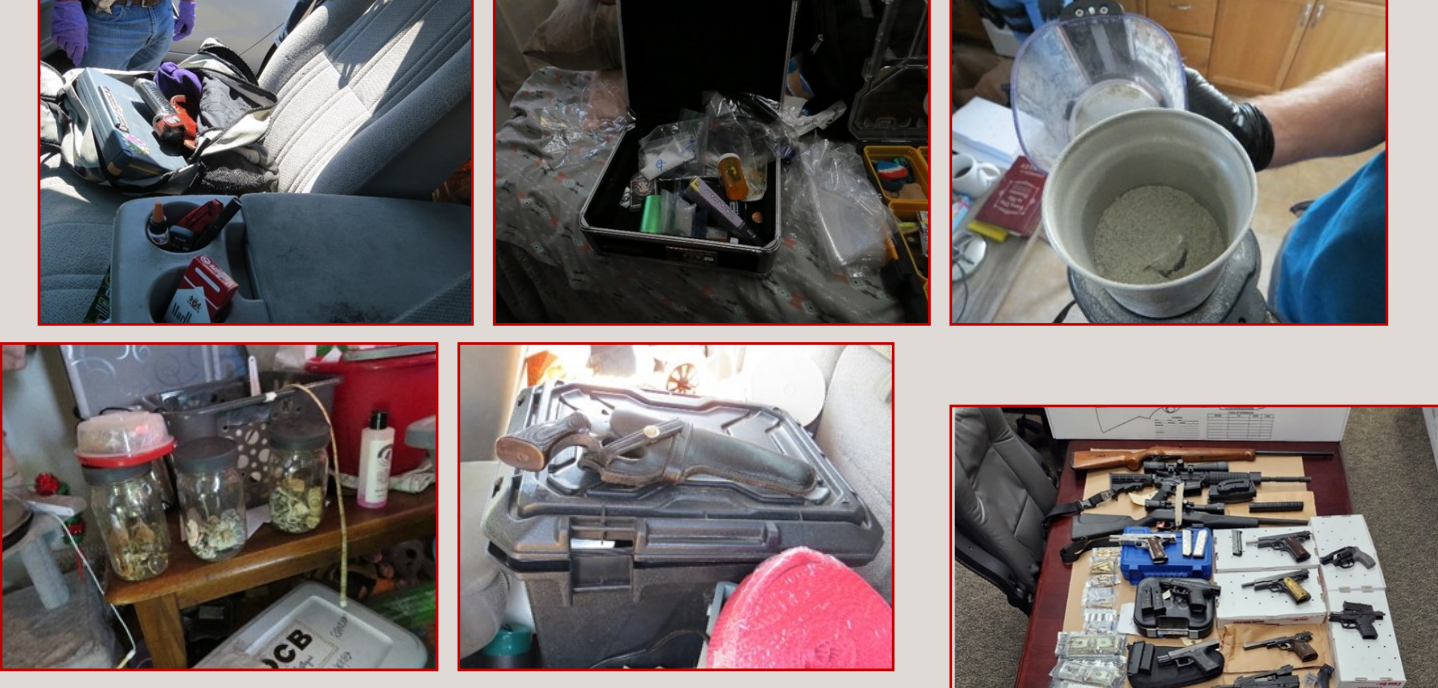
Pictured above: mushrooms, LSD, cocaine, fentanyl pills, and firearms seizure

• During August 2023, BENT concluded a long term investigation of a Pendleton man. Detectives identified the suspect as a psilocybin and cocaine trafficker in Umatilla County. At the conclusion of the investigation BENT executed a residential search warrant in Pendleton, Oregon. Throughout the investigation BENT seized a total of approximately 1,768.3 grams of psilocybin mushrooms, 7 dosage units of LSD, 81.6 grams of cocaine, a small amount of fentanyl pills, 2 handguns, and subsequently the arrest of one suspect.