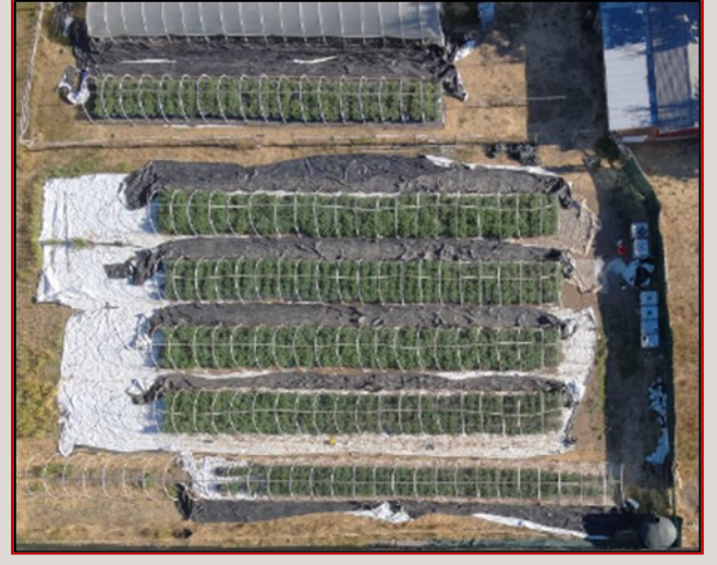
Pictured above: illegal marijuana grow at Rogue River properties

Jackson County Sheriff Office's Code Enforcement issued $8,000 in citations to the property owner. The property owner is also facing violations for an illegal well and misappropriation of water from a nearby creek.