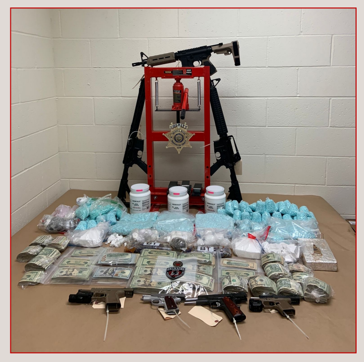
Seizure from search warrant on Honduran DTO

In total, the WIN team seized 4.6 kilograms of fentanyl powder, 9.5 kilograms of fentanyl pills, 1.5 kilograms of heroin, 200g of methamphetamine, 155g of cocaine, 7 firearms, 1 kilogram hydraulic press, 1 vehicle, and over $50,000 in cash. Five suspects were taken into federal custody and later indicted on the charges.