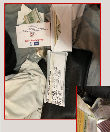
Pictured left and below: cash and narcotics seized from Acuna

HIT conducted a consent search of Acuna's vehicle and residence after the arrest. Officers found $25,000 cash, several bags of mushrooms, 500 LSD tabs, along with small amounts of MDMA and Ketamine. It was also discovered that Acuna was shipping drugs out of state via USPS.