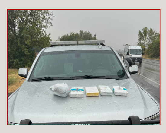
14.1 lbs. of fentanyl powder seized