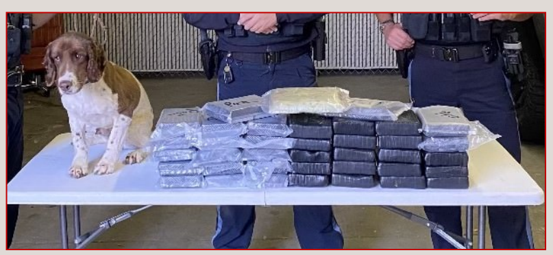
K9 Marley with fentanyl and cocaine seizure

K9 Marley was deployed and alerted to the odor of narcotics. A search warrant was applied for and granted. While searching the vehicle, over 10,000 fentanyl pills and 92 lbs. of cocaine were seized.