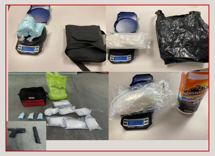
Pictured above: fentanyl pills, methamphetamine and firearm seizure

During the 3rd quarter of 2023, two other DTO members were arrested. These additional arrests lead to a seizure of over one pound of methamphetamine, about 100 fentanyl pills and one firearm. All suspects are facing charges associated with commercial drug offenses and two suspects are facing charges associated with the possession of a firearm.