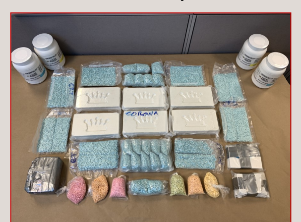
Fentanyl pills and powder seizure