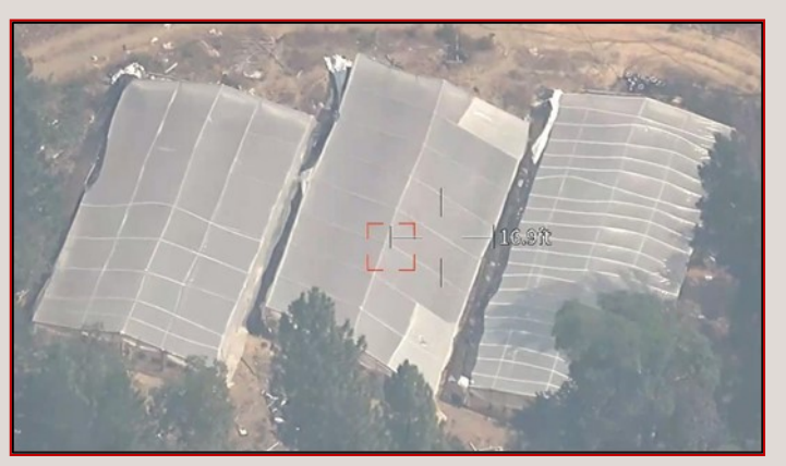
Pictured above: Rogue River illegal marijuana grow

• IMET served a search warrant at a property in White City, OR with assistance from Jackson County Sheriff Office's deputies and detectives. The search warrant resulted in the destruction of 972 illegal marijuana plants. A total of six firearms were seized. One suspect was cited and released for manufacturing marijuana and an arrest warrant has been requested for another subject.