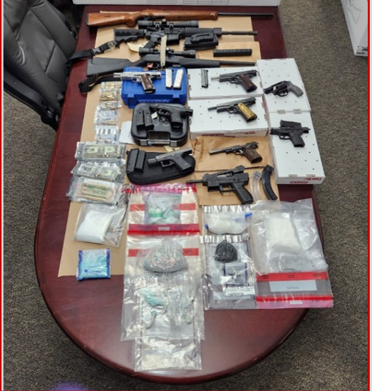
Pictured above: cocaine, fentanyl pills, heroin, methamphetamine, firearms, and cash seized from Cornejo

During the service of the search warrant, BENT detectives located approximately 550.0 grams of suspected cocaine, 204.0 grams of suspected methamphetamine, 6,418 suspected fentanyl pills, 185 grams of suspected heroin, $3,988.00 in US currency, 9 handguns (including one silencer), 3 rifles, packaging material and other items associated with the distribution of illegal controlled substances.