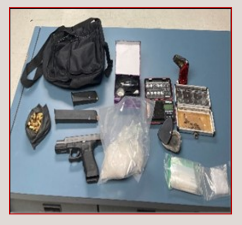
Pictured above: methamphetamine, cash, and firearm seized in Bonneville County

• On September 22, 2023, an Idaho State Police Trooper conducted a traffic stop in Shoshone County on a gray Nissan Altima with Montana plates for window tint violation.