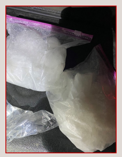
Pictured above: methamphetamine seized from Plazola

CODE conducted a search warrant on a residence where Plazola and Moore were staying. Multiple firearms were located in Moore's bedroom and in the home. Both Plazola and Moore are convicted felons. The investigation revealed that Plazola and Moore were possessing and delivering large quantities of methamphetamine in Deschutes County.