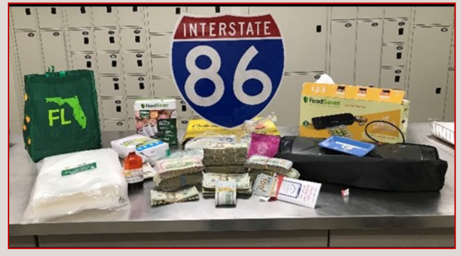
Pictured above: seized from Kia

During the stop, the trooper observed signs of criminal behavior and requested a K9 to perform an open-air sniff. After a positive alert from the K9, a search of the vehicle was performed. While conducting the search of the vehicle, the trooper located 12.8 ounces of methamphetamine, $7,329 in cash, and 1 pistol.