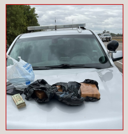
70,000 fentanyl pill seizure

• On September 28, 2023, an OSP Trooper and K9 Marley stopped a vehicle for a traffic violation on I-5 north near MP 215 in Linn County. During enforcement action, the trooper became suspicious the occupants were involved in criminal activity.