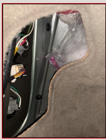
Pictured below: drugs and firearms seized during Central Point search warrant

• MADGE detectives made contact with a suspect they had been investigating for selling methamphetamine in the Medford, OR area. The suspect was on probation for past drug convictions. MADGE located two pounds of methamphetamine inside the bag he was in possession of. The suspect was charged and is facing prison time.