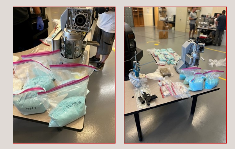
Pictured above and left: fentanyl, paraphernalia and handgun seized from DTO

• MCSO DDT had another seizure that produced roughly $12,000 and over 3.5 lbs of cocaine, as well as producing new leads to further other investigations. DDT also seized several dangerous firearms during the search warrant, including handguns, rifles, and a suppressor.