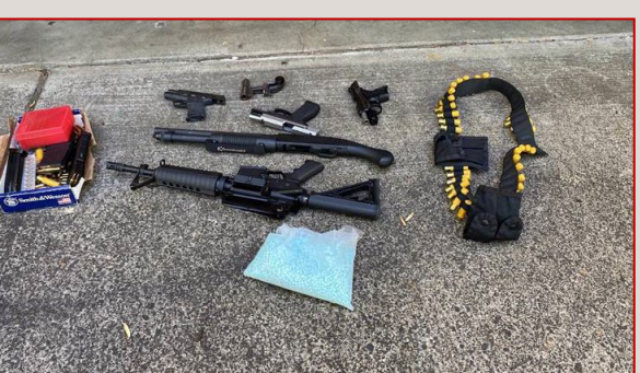
Fentanyl pills and firearms seizure

The WIN team seized approximately 10,000 fentanyl pills and 6 firearms.