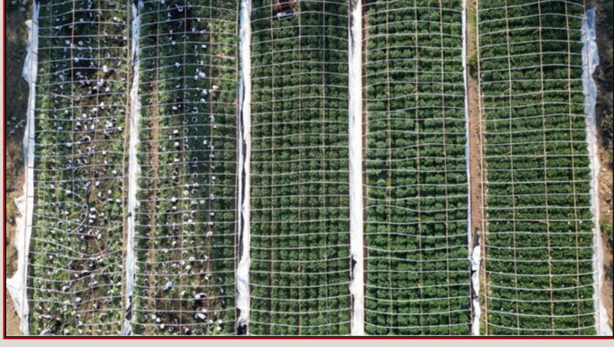
Illegal marijuana grow destroyed by IMET

Two subjects were cited and released for possession, manufacturing, and distribution of marijuana. One subject was also charged with illegal import/export of marijuana. Charges are pending at the District Attorney's Office for other individuals. Jackson County Sheriff Office's Code Enforcement issued the property owner $277,860 in citations for all three properties.