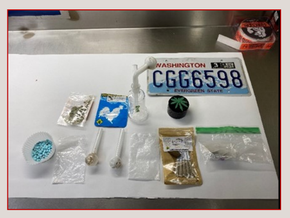
Pictured above: fentanyl, marijuana, and methamphetamine seized in Shoshone County

While conducting a search of the vehicle, the trooper located 1,178 dosage units of fentanyl, 6.6 grams of marijuana, .11 grams of methamphetamine, and a stolen Washington license plate.