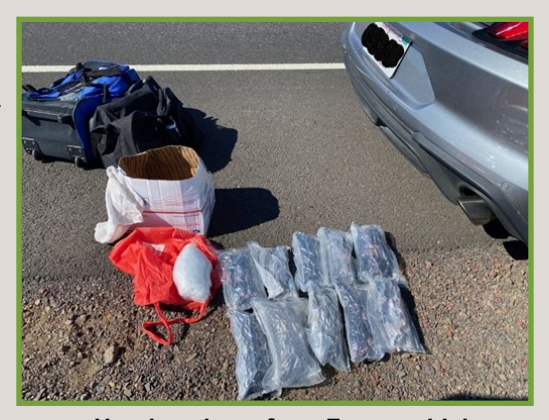
Heroin seizure from Facey vehicle

OSP troopers were assisted during the investigation by detectives from the OSP-Criminal Investigations Division-Drug Enforcement Section (Domestic Highway Enforcement Initiative) and the US Department of Homeland Security – Homeland Security Investigations (Medford).