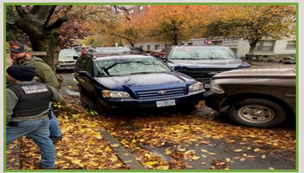
Vehicle pin on Diaz

65.4grams of cocaine, 339 grams of marijuana, 135 grams of mushrooms, 1,608 grams of Alprazolam (Xanax), a .25 caliber pistol, and a 12-gauge shotgun.