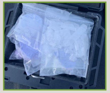
Fentanyl powder/methamphetamine seizure

♦ MADGE executed a search warrant in Medford which resulted in the arrest of two suspects for Schedule II Controlled Substance − Fentanyl. By the end of the search warrant MADGE seized 1.23 pounds of fentanyl powder, 64 fentanyl pills, 15.85 grams of methamphetamine, and one gram of heroin.