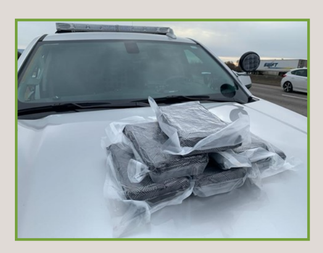
Pictured above/left: Cocaine seized from Honda Accord