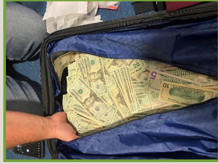
Pictured left and above: airport interdiction cash seizure