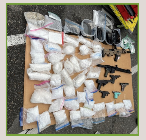
Len Bias investigation seizure

Level #3 became Cooperating Defendant #3 (CD3) and identified their source of supply as a dealer who sold multiple pounds of methamphetamine at a time, Level #4 for the Len Bias investigation . Further investigation revealed that CCITF's Level #4 was a primary target of an ongoing investigation by Multnomah County's Special Investigations Unit (SIU). The primary case agents were able to discuss both investigations and CCITF assisted SIU in a search warrant at Level #4's residence and storage unit in early December 2022 where an impressive amount of drugs were seized; including 39.7 pounds of methamphetamine, 949.8 grams of cocaine, 4.375 kilograms of heroin, 844.9 grams fentanyl powder, and 1,700 fentanyl pills, as well as psilocybin mushrooms, cash, and multiple firearms.