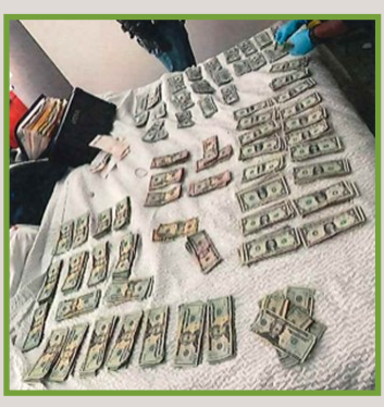
Over $60,000 cash seizure

• Another notable case in December 2022 came from the Probation Officer assigned to DDT. He identified a suspect with warrants and his current whereabouts. The suspect was also presumed to be dealing fentanyl.