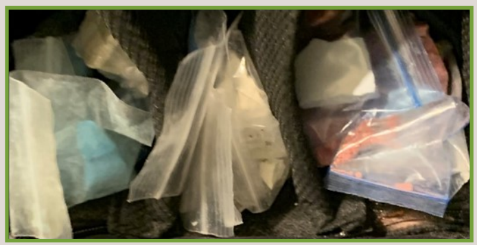
Fentanyl powder, pills, methamphetamine, heroin seizure from Medford search warrant

♦ MADGE executed a search warrant in Medford which resulted in the arrest of two suspects for Schedule II Controlled Substance − Fentanyl. By the end of the search warrant MADGE seized 1.23 pounds of fentanyl powder, 64 fentanyl pills, 15.85 grams of methamphetamine, and one gram of heroin.