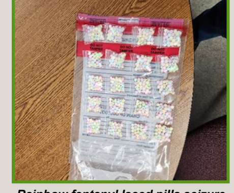
Rainbow fentanyl laced pills seizure

The suspect was arrested and is awaiting trial.