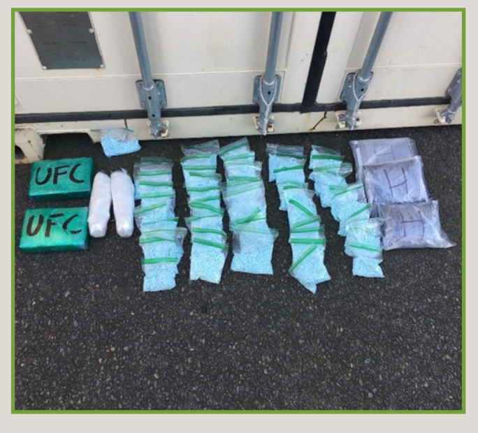
K9 "Chase" with cocaine, methamphetamine, and pill seizure