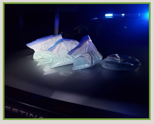
Fentanyl pill seizure

During a search of the vehicle, the trooper located five large plastic bags containing suspected fentanyl pills concealed in the trunk of the vehicle.