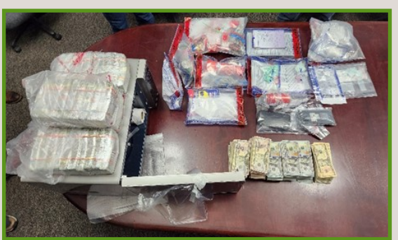
Pictured right: 6,293.6 grams methamphetamine seizure

• On December 12, 2022, BENT, in collaboration with Drug Enforcement Administration (DEA) Tacoma, concluded a long term investigation subsequently seizing a total of 6,293.6 grams of methamphetamine.