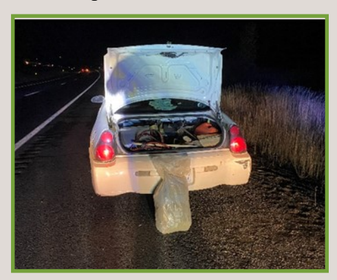
Marijuana seized from Monte Carlo

During the stop, the trooper observed signs of recent drug use along with the driver admitting to having marijuana in the vehicle. While conducting a search of the vehicle, the trooper located a large bag of marijuana (15 pounds) and 5.5 grams of methamphetamine.