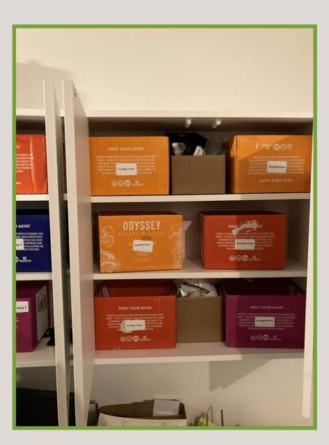
Psilocybin mushrooms and edibles seizure

• On December 3rd, 2022, members of the HIDTA Interdiction Taskforce (HIT) worked bus interdiction in the Portland Metropolitan Area. HIT contacted and gained consent to search the luggage of three separate subjects traveling northbound from California.