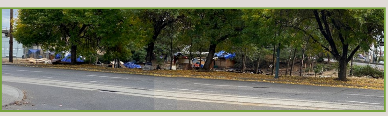
DTO homeless camp