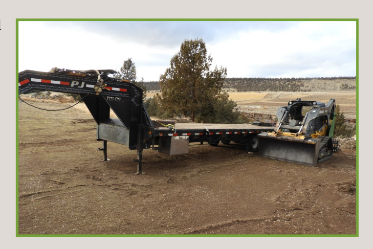
Pictured above and left: stolen equipment recovered from Weston